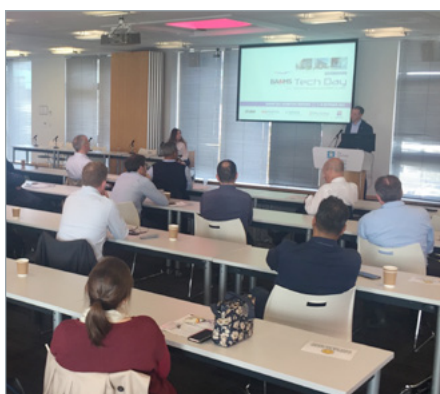
ABOVE: TECH DAY AT AMRC

McLaren exotic hi-tech supercar McLaren: definitely the 'right fit' AMRC panel Insights into technology-shaping surgery