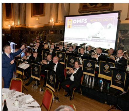
ABOVE: GRIMETHORPE BAND

Ultrasound Implants & Planning Nasendoscopy