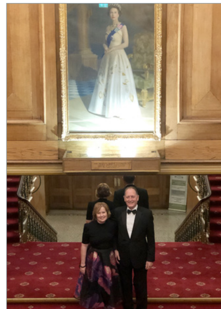
ABOVE: DIAMOND CENTRE CONCOURSE AT THE ASM & THE IMPRESSIVE MAIN STAIRCASE AT CUTLERS' HALL ANNUAL DINNER