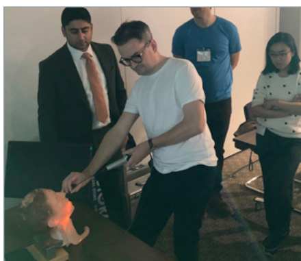
ABOVE: WORKSHOPS AT INOX

Ultrasound Implants & Planning Nasendoscopy